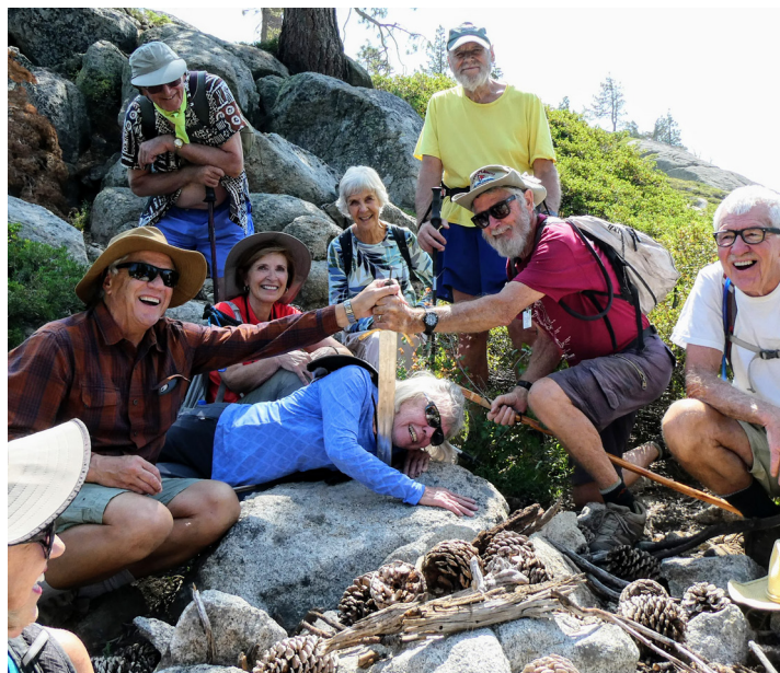
OLLI Outdoors members relax at Donner Summit.

Light Hikers will explore trails and paths in the Truckee Meadows and surrounding areas. Light Hikes are usually