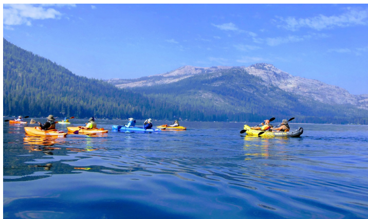
OLLI Outdoors members paddle kayaks.

Enjoy riding along established bike paths in the early morning hours when the temperature is still cool. Rides may be in Reno, Sparks, Washoe Valley or the Lake Tahoe Basin. Rides are usually 10-18 miles in length and typically take 2-3 hours, with minimal street riding. For complete, up to date information on the locations, times, equipment and preparation necessary to participate, please visit the cycling section at https://ollireno.com/outdoor . At a minimum, you are required to wear a helmet, and will not be allowed to participate without one.