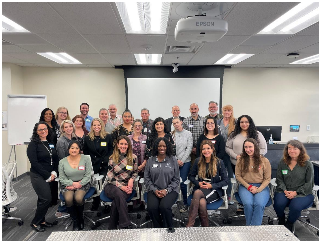
Figure 2: Psychiatry department at our departmental retreat